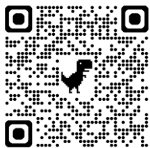
St. John's Website

We are moving into the digital age for your convenience! The following QR codes can help you navigate to the St. John's website, St. John's Facebook page and share your offerings through tithely.ly. Just scan the QR code and it will take you to that site.