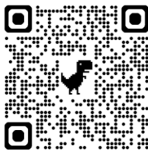
St. John's Facebook